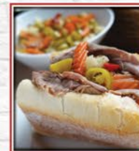
OLD NEIGHBORHOOD ITALIAN BEEF