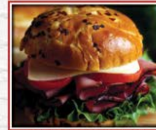
HAM & PROVOLONE SANDWICH

A mix of three sandwiches: The turkey sandwiches are served on a wheat roll topped with lettuce, tomato, and Swiss cheese. Ham on brioche with American cheese lettuce, and tomato. The roast beef with lettuce, tomato and cheddar cheese.