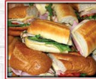
SPECIALTY SANDWICH TRAY