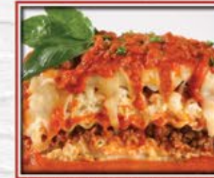
MAMMA SUE'S HOMEMADE LASAGNA