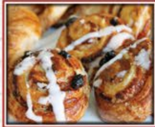
BREAKFAST PASTRY TRAY